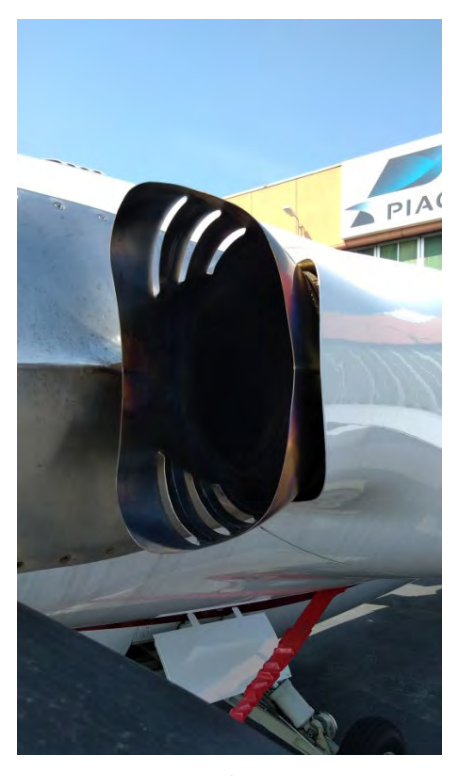
New Engine Exhaust Ducts