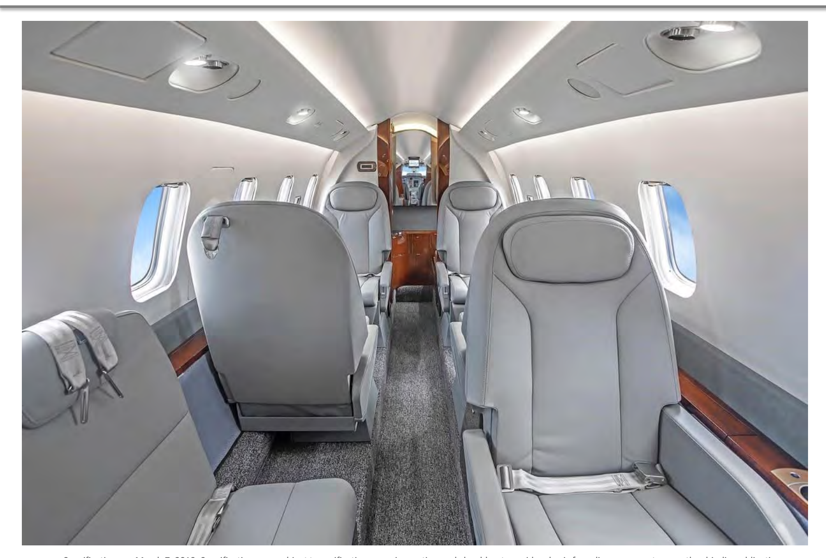
Specifications as March 7, 2019. Specifications are subject to verification upon inspection and should not provide a basis for reliance or create any other binding obligation.