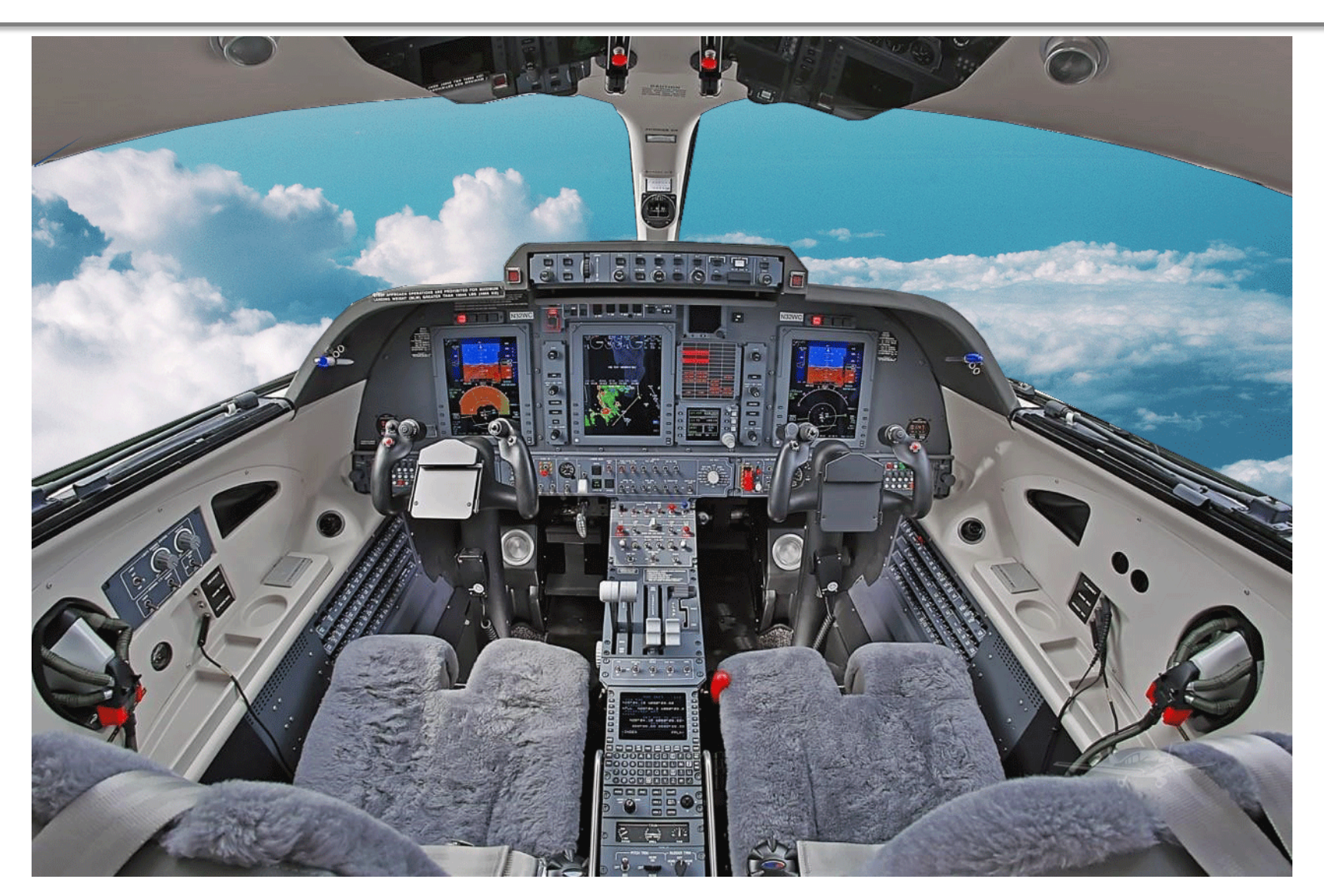
Specifications as March 7, 2019. Specifications are subject to verification upon inspection and should not provide a basis for reliance or create any other binding obligation.