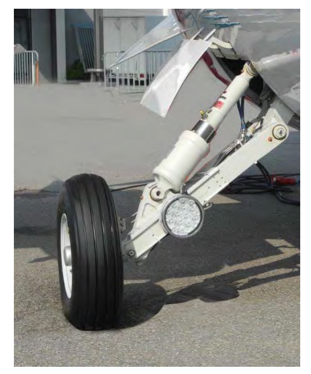
New Landing Gear with automatic steering and anti-skid systems