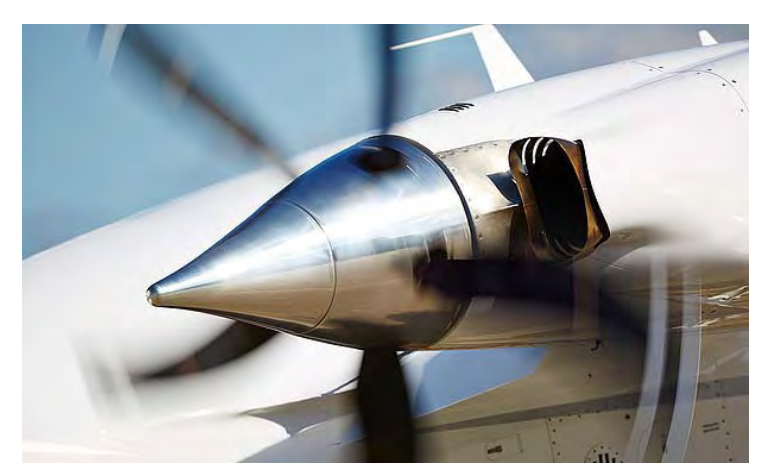
Hartzell HC-E5N Five-Blade Scimitar Props