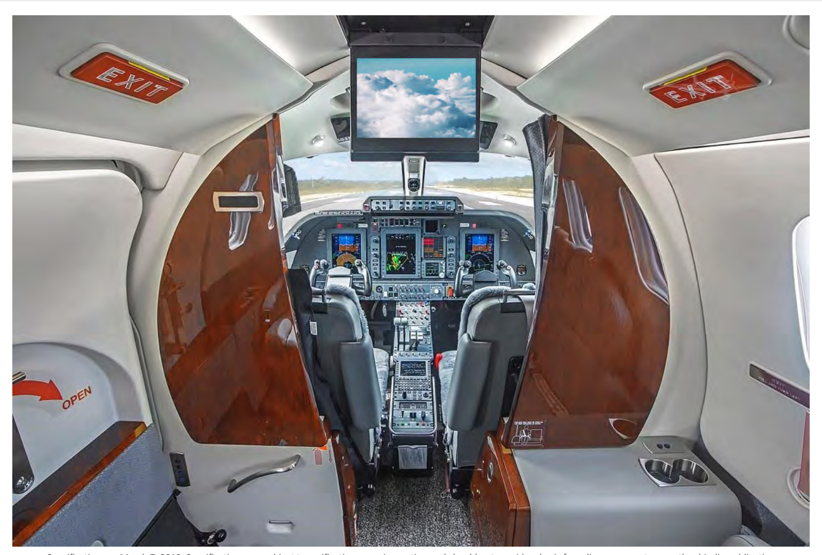
Specifications as March 7, 2019. Specifications are subject to verification upon inspection and should not provide a basis for reliance or create any other binding obligation.