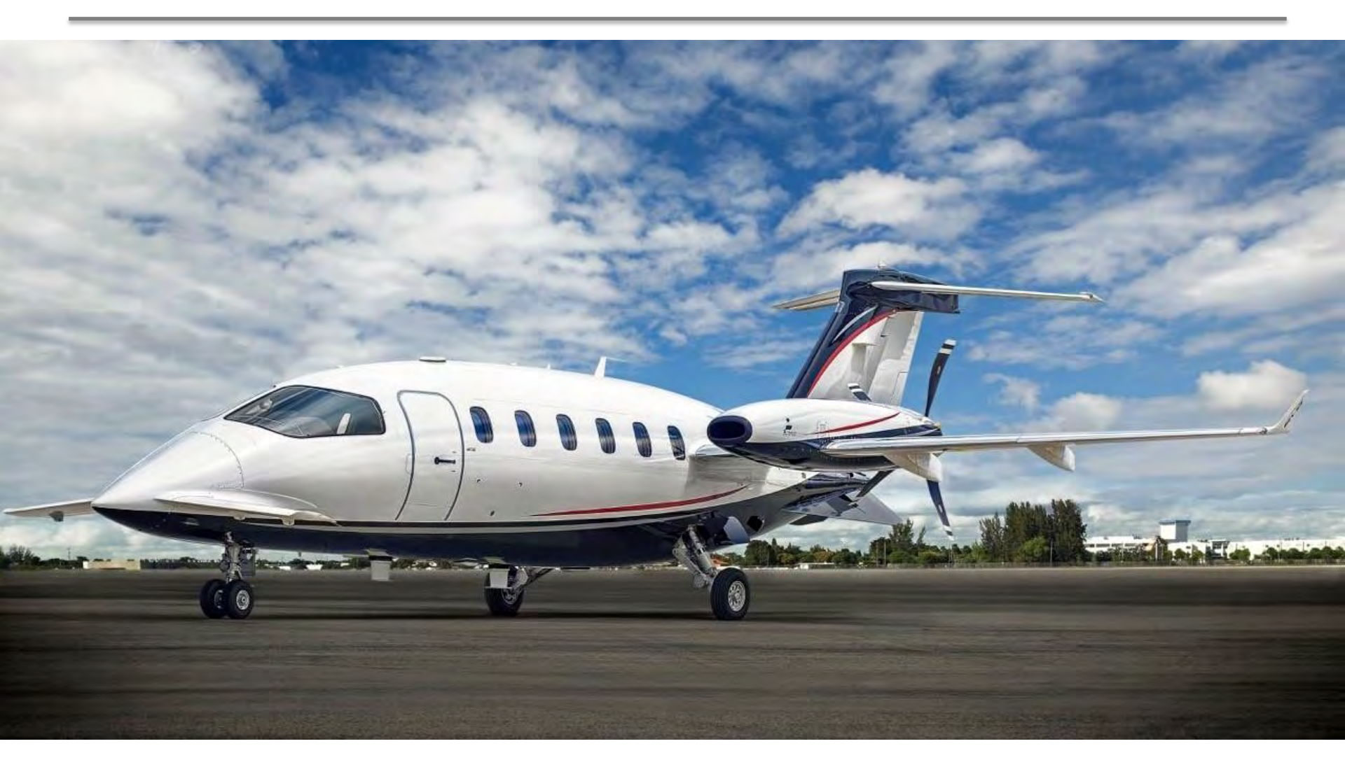
Custom Paint – Overall Matterhorn White with Sunfast Red, Superjet Black and Bright Aluminum Stripes

Specifications as March 7, 2019. Specifications are subject to verification upon inspection and should not provide a basis for reliance or create any other binding obligation.