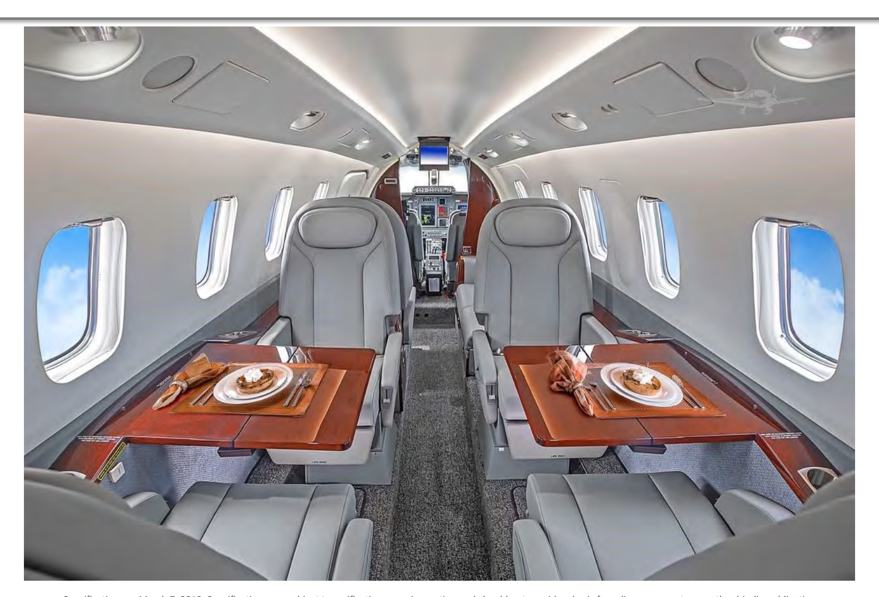
Specifications as March 7, 2019. Specifications are subject to verification upon inspection and should not provide a basis for reliance or create any other binding obligation.